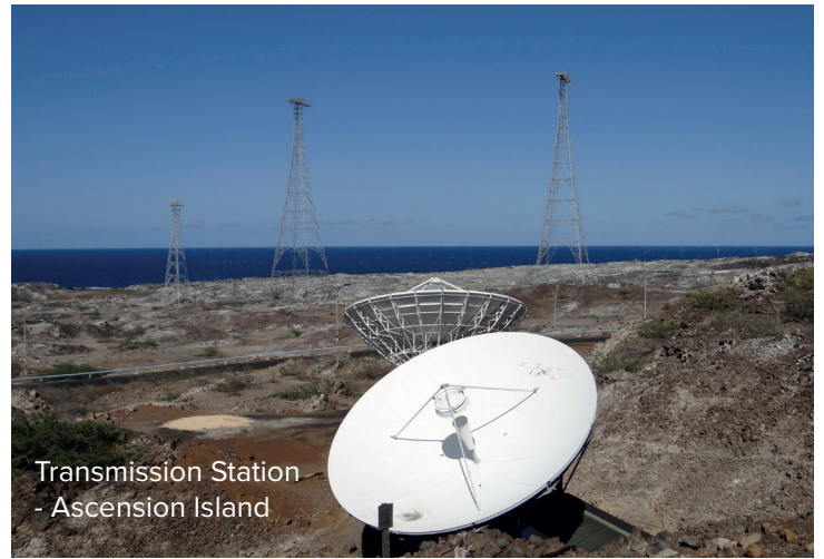
Transmission Station - Ascension Island