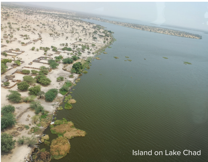
Island on Lake Chad