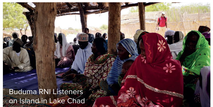
Buduma RNI Listeners on Island in Lake Chad